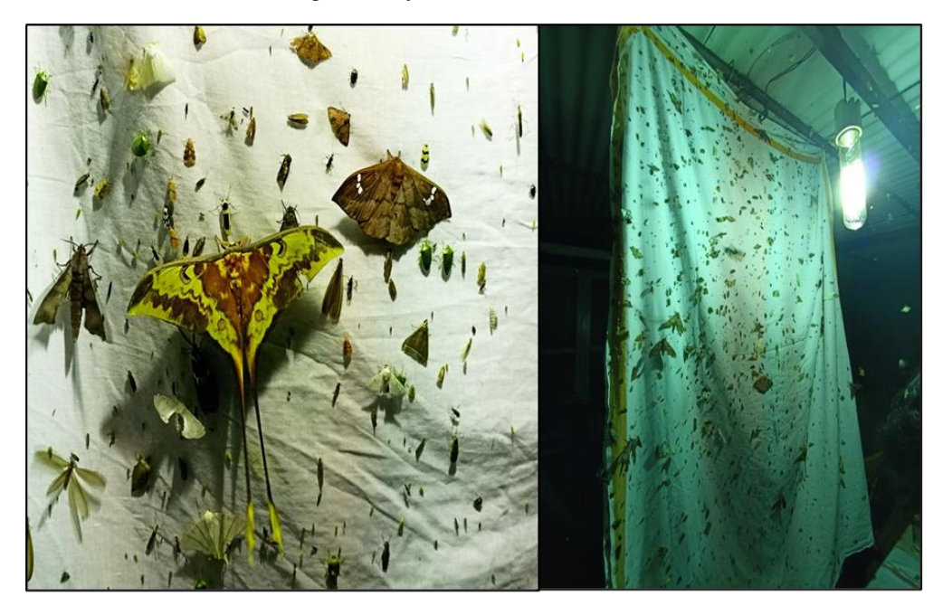
Figure 1. Moth trapping was carried out using a 4x5 feet white cloth and a 240-Watt mercury vapor bulb.

1. Sampling Equipment: Moth trapping was carried out using a 4x5 feet white cloth and a 240-Watt mercury vapor bulb, and its setup is shown in (Figure 1). This combination effectively attracted moths during the sampling period.